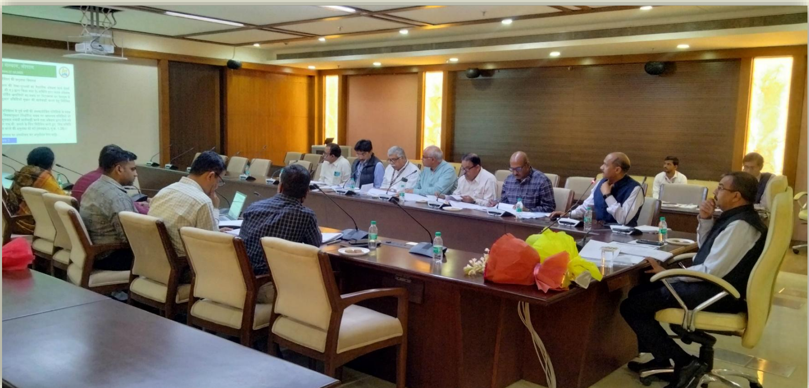
Executive Committee Meeting with under the Chairmanship of Respected Additional Chief Secretary, Department of Higher Education, Govt. of Madhya Pradesh