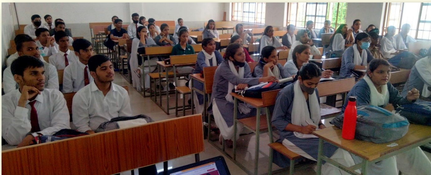
Orientation Programme of NPTEL Courses

Since its inception in 2017, IEHE has proudly served as an active SWAYAM-NPTEL Local Chapter in collaboration with IIT Madras, bringing world-class, curriculum-based online education right to our campus. This initiative is a transformative step toward empowering students and faculty with access to high-quality courses developed by India's premier institutions like IITs, NITs, IISER, IISc, IIMs etc. With the vision of creating a culture of continuous and self-driven learning, the Local Chapter has become a vibrant hub of academic excellence and innovation. Our students have consistently excelled in NPTEL courses, earning numerous certifications, while our dedicated faculty mentors ensure personalized guidance and motivation throughout the learning journey. The chapter has received multiple praises for its outstanding performance and has significantly contributed to enhancing the skill sets and academic profiles of our learners. As we move forward, our commitment to leveraging SWAYAM-NPTEL remains strong, reinforcing our position as a centre of excellence in digital learning and holistic education.