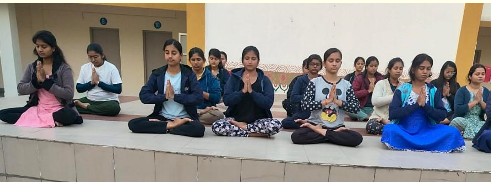
Students of Girls Hostel “Ojaswini” participating in Daily Yoga

*Mess Charges – The mess charges will be determined according to the mess tender. If the tender changes in the middle of the session, the mess charges will also be changed accordingly.