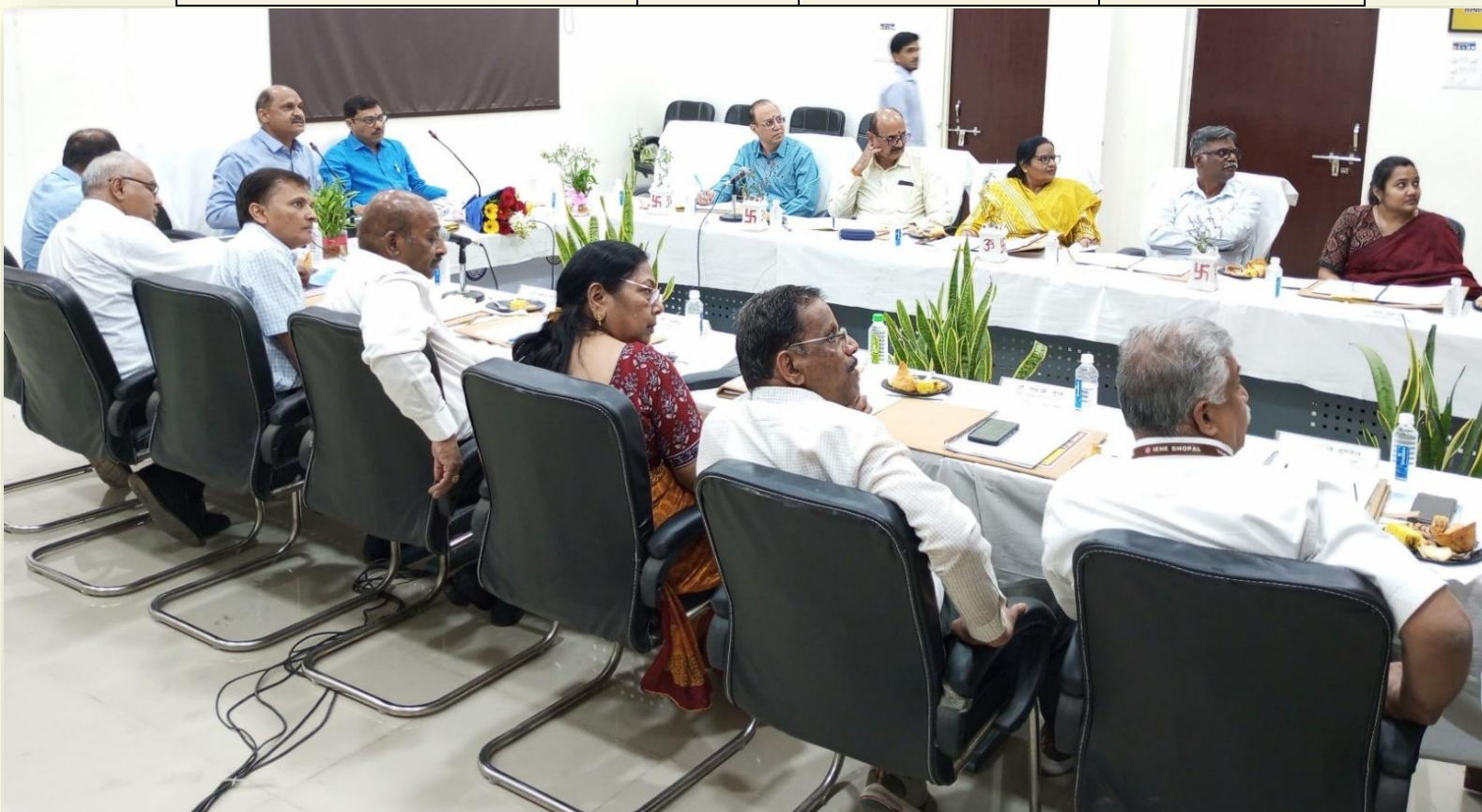
Meeting of the Governing Body of the Institute