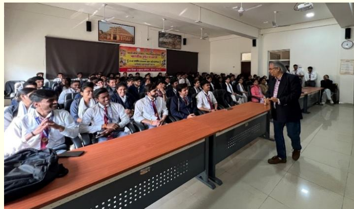
Expert Lecture on ‘Talent vs Skill

Note: Students having any unique idea and/or are interested in establishing their startups/entrepreneurial setups can register in the student’s E-Cell Committee and can participate in various entrepreneurial activities.