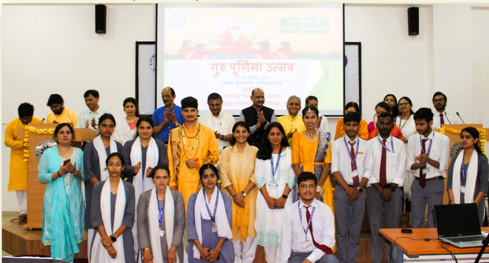
Celebration of "GURU-POORNIMA UTSAV"

Note: *The above fee structure is subject to change as per the decision of the General Body of the Institute.*Once in a year at the time of admission.