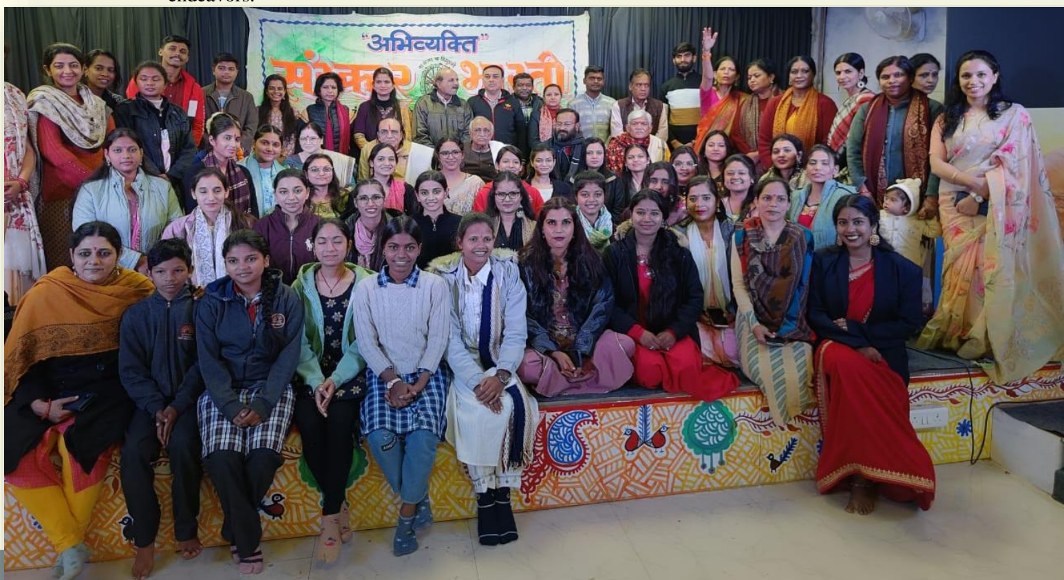
The students from girls hostel "OJASWINI" participating in the Cultural Event