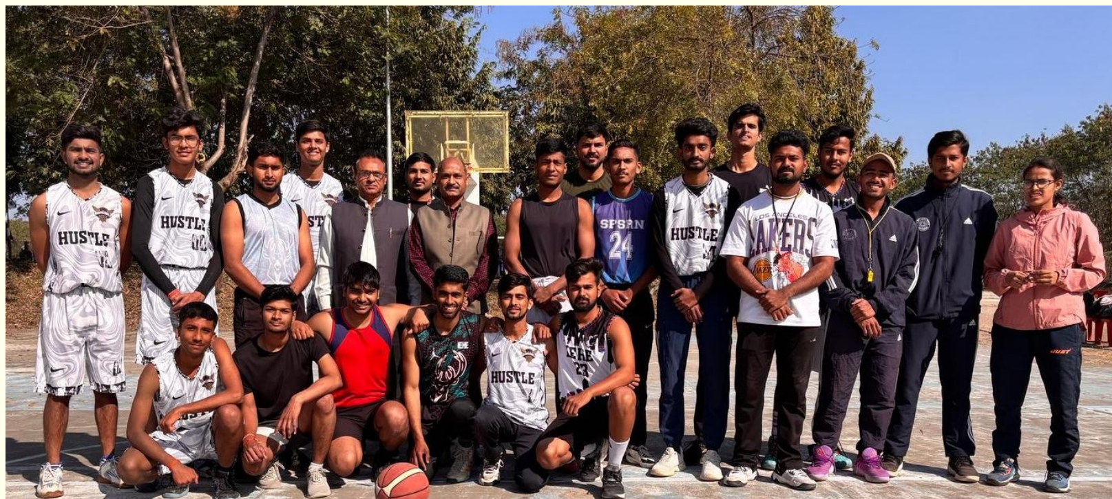
Basketball Team of the Institute