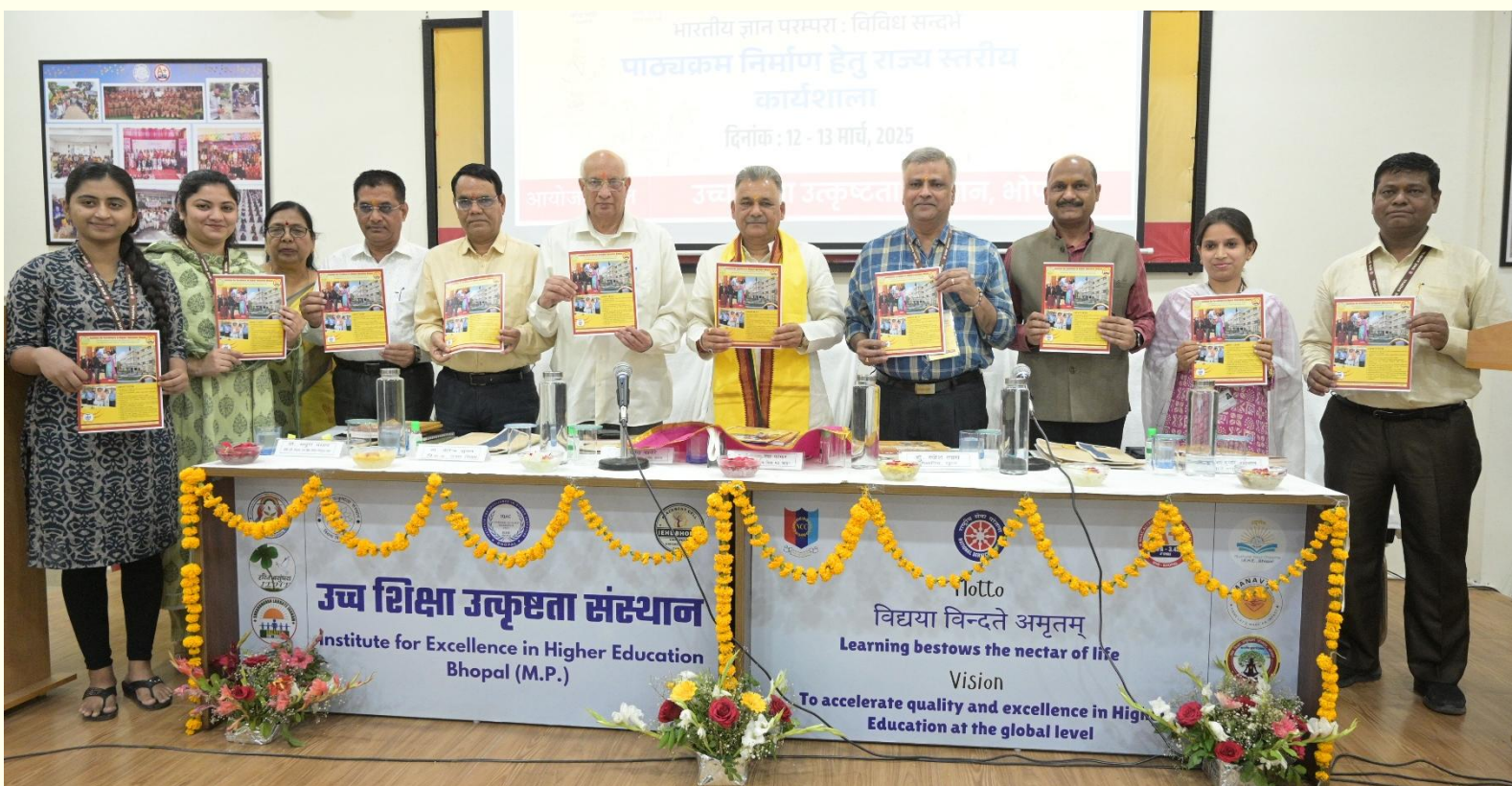
Inauguration of Institutes Brochure by Hon'ble Minister of Higher Education Shri Inder Singh Parmar Ji, Government of M.P and other respected dignitaries