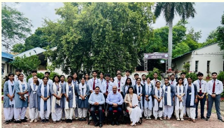
Team Udgam with the Director