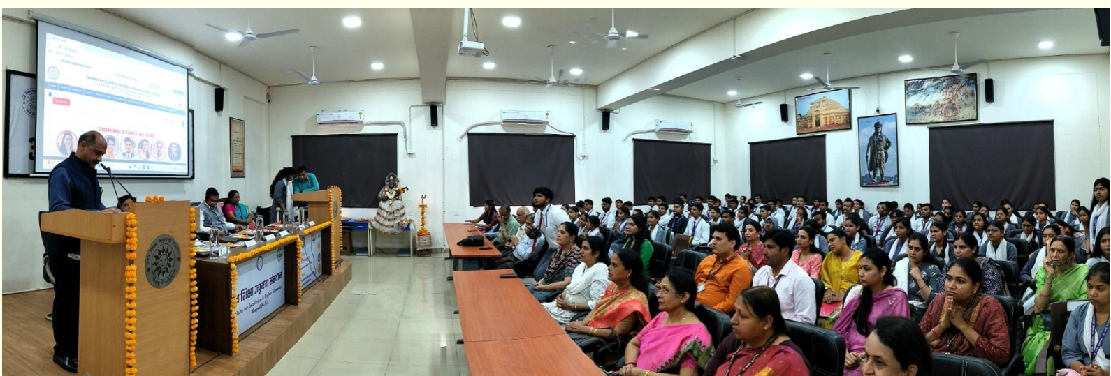
Inaugural Session of Two Days State Level Workshop on inclusion of IKS in Syllabi of UG Courses

In a rapidly modernizing world, efforts like these ensure that the essence of India’s enduring wisdom is not only preserved but also embraced as a guiding light for generations to come. By weaving traditional knowledge into the fabric of modern education, the IKS truly embodies the spirit of inclusive and holistic well-being.