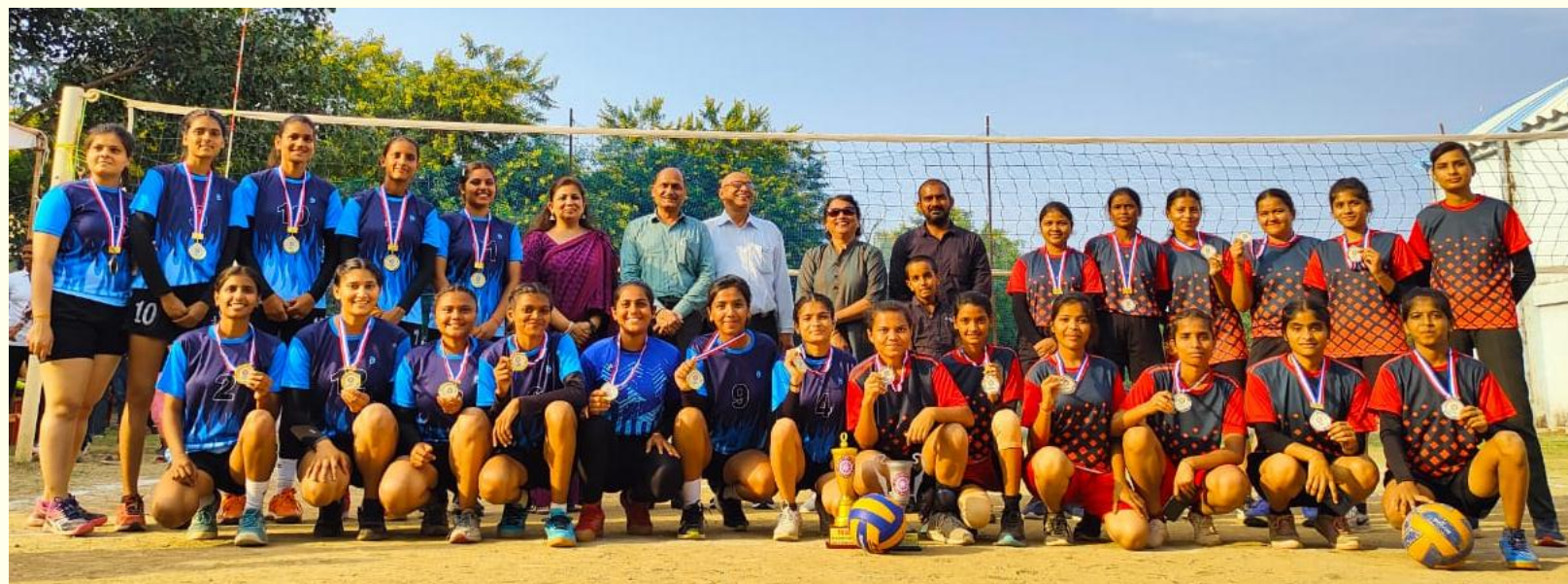
Divison Level Volleyball Competition

The Sports Department at IEHE plays a vital role in students' holistic development by fostering physical fitness, teamwork, discipline, and a healthy competitive spirit. With a wide range of indoor and outdoor activities, modern facilities, experienced coaches, and structured programs for both beginners and advanced athletes, the department promotes leadership, resilience, and a balanced lifestyle to prepare students for future challenges. Active participation in sports helps students develop qualities like perseverance and fair play, alongside excelling in academics and mental well-being. The institute organizes various events, including the Annual Sports Meet featuring athletics, cricket, football, volleyball, badminton, and table tennis, inter-college tournaments, friendly matches, weekly training sessions, and specialized coaching camps for promising athletes. Many students have achieved selection for district and state-level teams in cricket and athletics, showcasing the institute's commitment to nurturing talent and promoting excellence in sports.