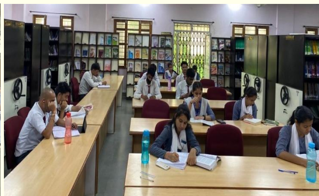
Whispers of Knowledge in every corner of Library