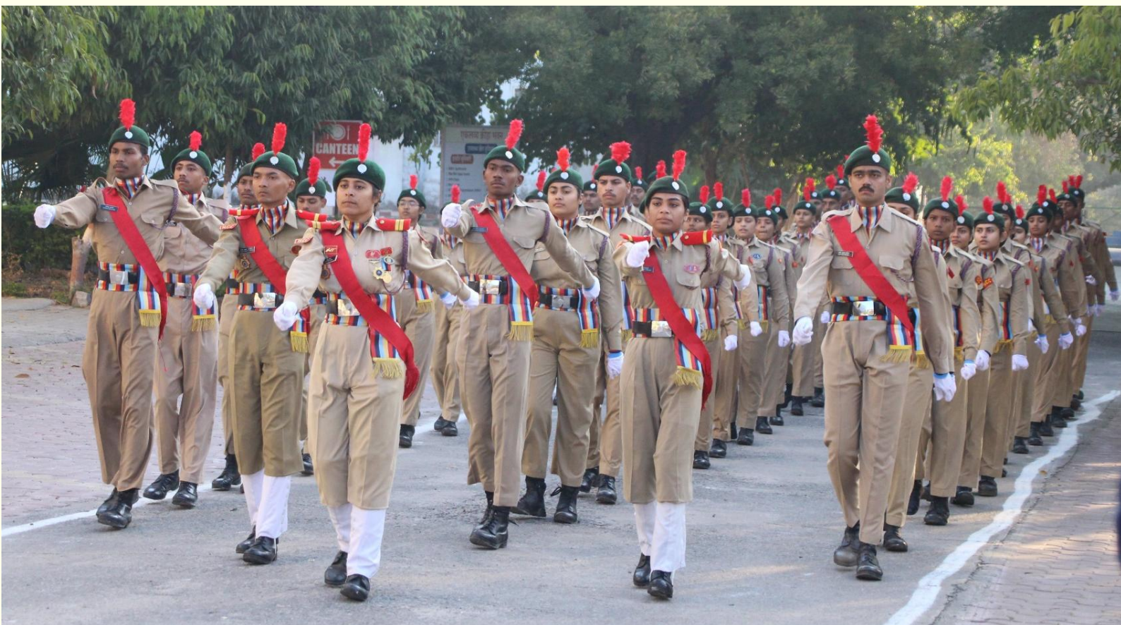
NCC Parade on Republic Day Celebration