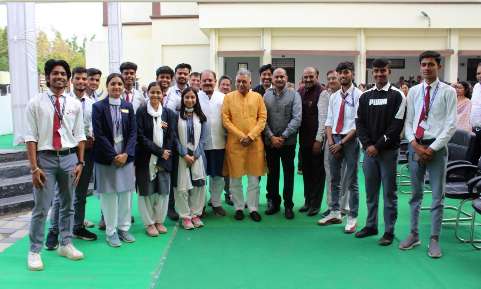
Hon'ble Minister of Higher Education Shri Inder Singh Parmar Ji, Government of M.P and Hon'ble MLA (Bhopal Dakshin-Pashchim) Shri Bhagwandas Sabnanai Ji with the Students of Institute